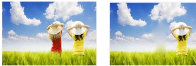
Fig.6. Distorted Images on the left side along with Inpainted Images on the right side