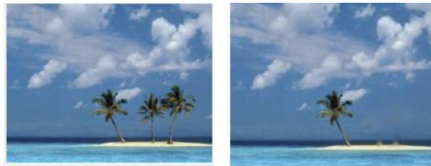
Fig.5. Distorted Images on the left side along with Inpainted Images on the right side