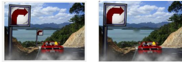
Fig.4. Distorted Images on the left side along with Inpainted Images on the right side