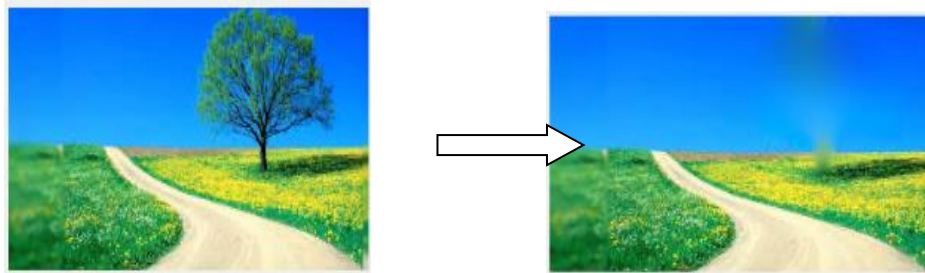
Fig.1. removing large objects from image

The filling-in of missing region in an image is known as Image Inpainting. Inpainting is the art of reconstructing an image or video in a form that is not easily detectable by an human perception. Image Inpainting has become a fundamental area of research in image processing. The reconstruction of images in a way that is non-detectable for an observer who does not know the original image is a practice as old as artistic creation itself. This practice is called ‘retouching’ or ‘Inpainting’. Also image Inpainting has been widely investigated in the applications of digital effect (i.e. object removal, image editing, image resizing), image restoration (e.g. Scratch or text removal in photograph), image coding and transmission (e.g. recovery of missing blocks). Image Inpainting could also be called as reconstruction process.